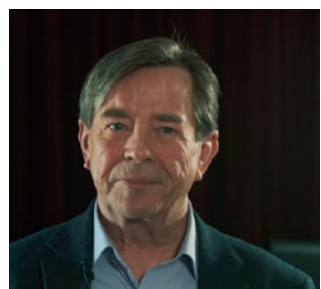
Chairman's Commendation Award – John Paul Young

We wanted to recognise the important contribution of our community by introducing the Variety Heart Awards. The Awards are a celebration of the heroes in the Variety community, those who embody our values of Equality, Community, Action and Joy.