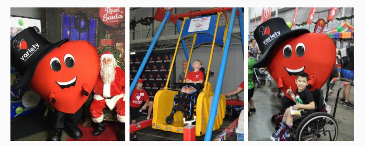
SPECIAL CHILDREN'S CHRISTMAS PARTY

If you think you may have an item, experience or idea that could work as an auction item please get in touch with Renee on 07 3907 9300 or renee.murtach@varietyqld.org.au