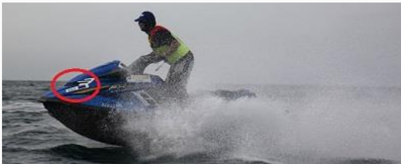
** Example of PWC number placement

You will receive 2 x large colour block & vehicle number decals + 2 small colour block decals for your PWC at registration & scrutineering in Bundaberg.