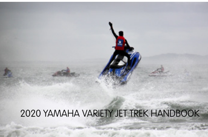
2020 YAMAHA VARIETY JET TREK HANDBOOK