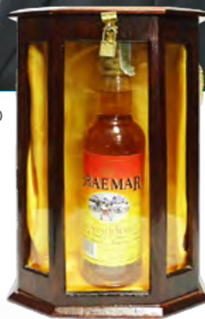
THE MILLION DOLLAR BRAEMAR SCOTCH BOTTLE