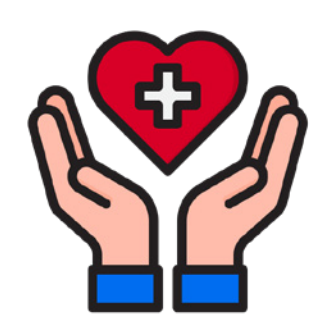
6 Sensory Rooms / Equipment