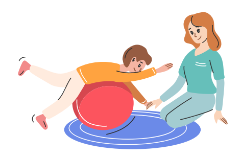
In Home Therapy