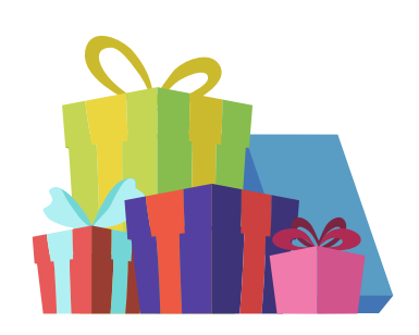
2472 Xmas Gifts