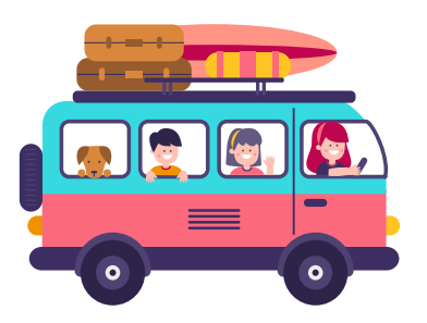
33,867 kids Outings / Experiences Transport