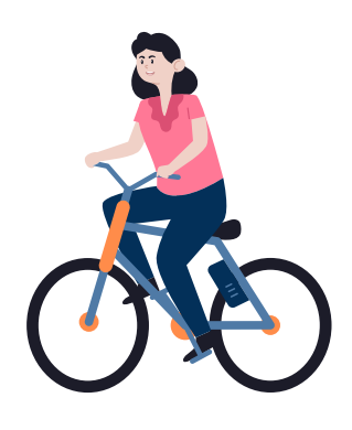
Bikes / Modified Scooter & Prams