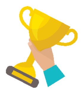
38 Scholarships in Sport & Arts