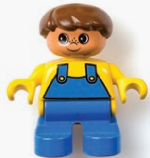
15 in home therapy/ therapy items