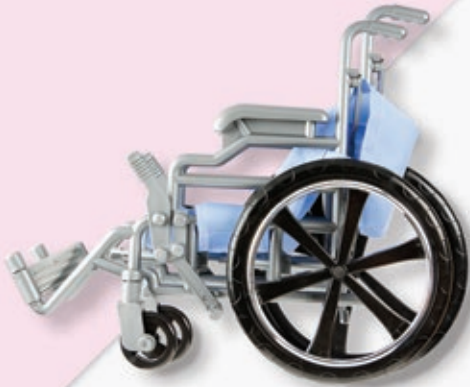
9 manual wheelchairs