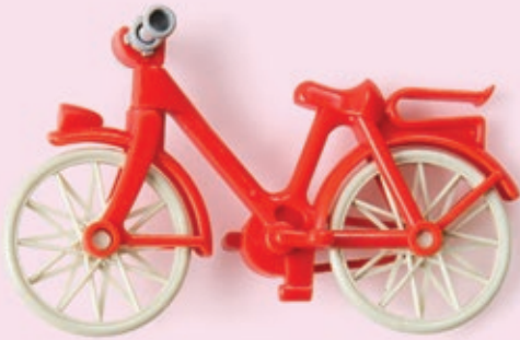
20 modified bikes/tricycles

In 2015, Variety granted 35 different types of equipment, services and experiences to individuals and organisations. Here are some of the ways Variety WA was able to make a difference: