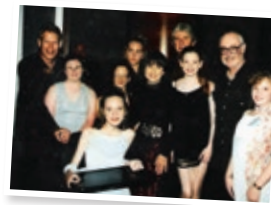
Brian Treasure Memorial Variety Scholarships founded