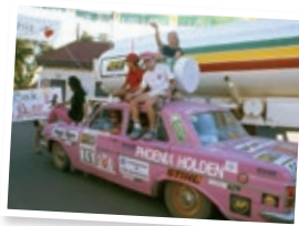
First Variety WA Bash is held with 95 people taking part in the Perth to Kalgoorlie trip