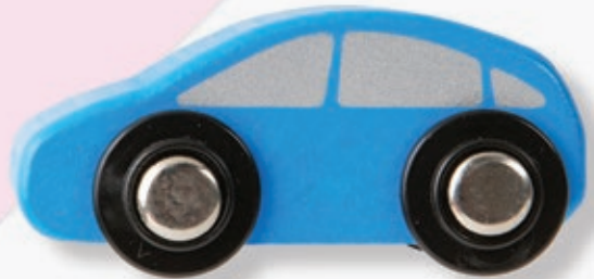
9 vehicle modifications