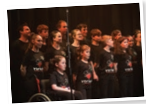
The Variety Youth Choir is founded