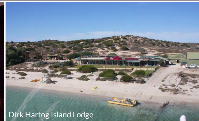
Dirk Hartog Island Lodge