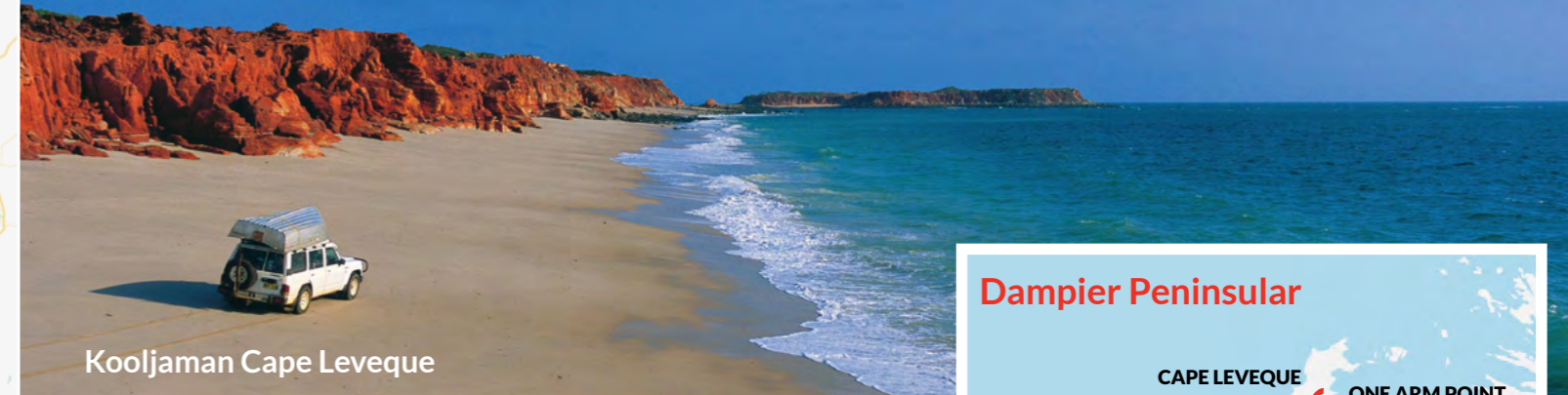
Kooljaman Cape Leveque