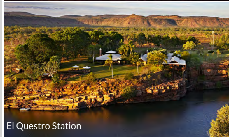
El Questro Station