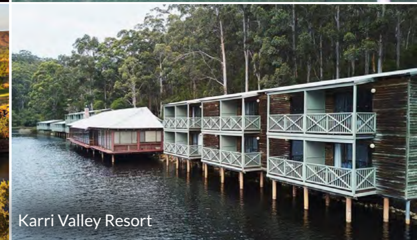
Karri Valley Resort