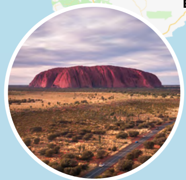
2018 Kalgoorlie to Uluru