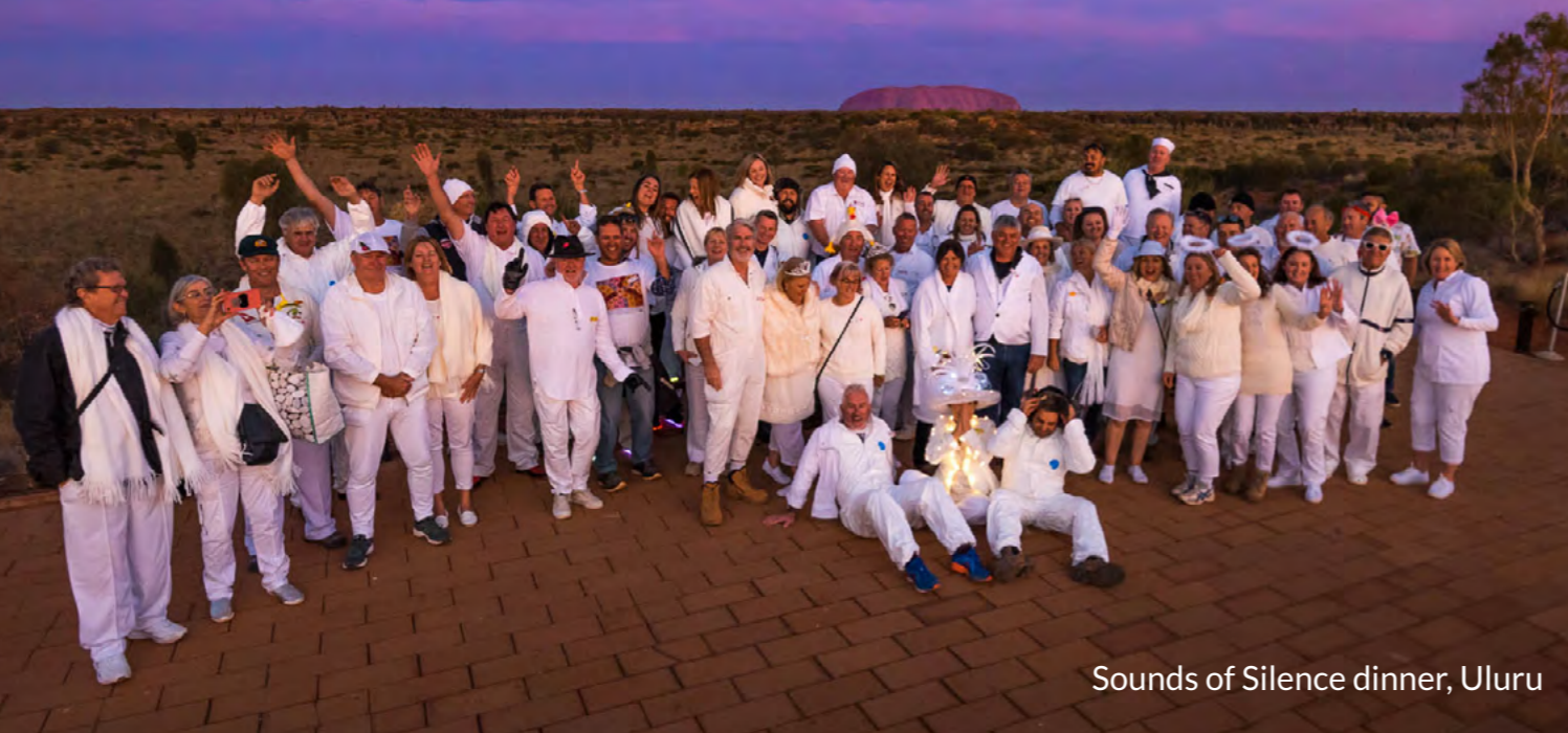
Sounds of Silence dinner, Uluru