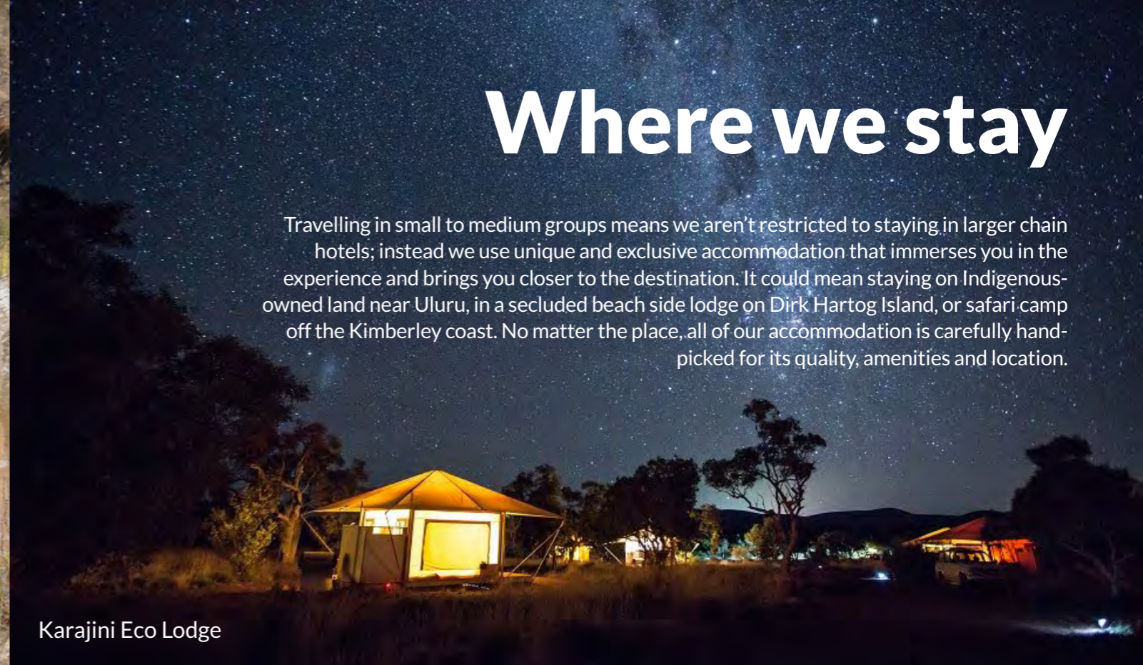
Karajini Eco Lodge

Travelling in small to medium groups means we aren't restricted to staying in larger chain hotels; instead we use unique and exclusive accommodation that immerses you in the experience and brings you closer to the destination. It could mean staying on Indigenous-owned land near Uluru, in a secluded beach side lodge on Dirk Hartog Island, or safari camp off the Kimberley coast. No matter the place, all of our accommodation is carefully hand-picked for its quality, amenities and location.