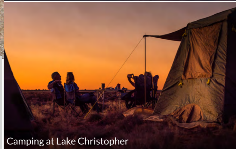
Camping at Lake Christopher