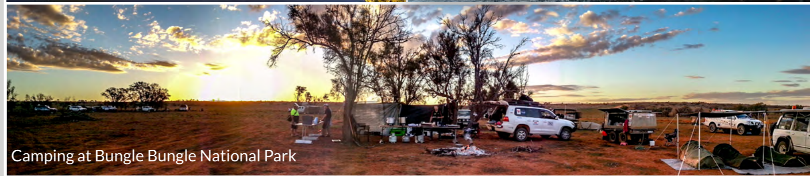
Camping at Bungle Bungle National Park