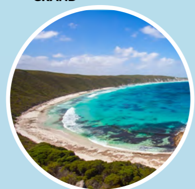
2012 Borossa to Esperance